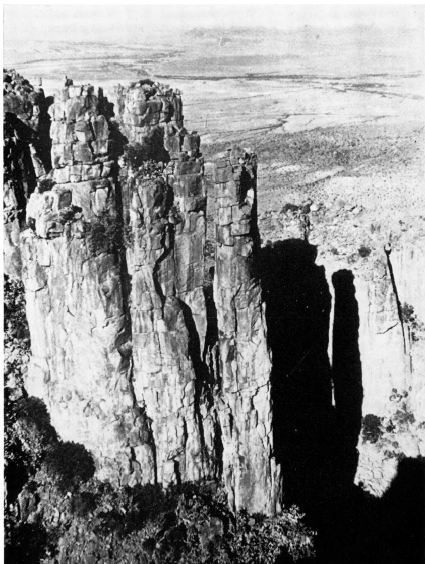
86 Unclimbed ironstone pillars, East Cape Province

The remote Karroo desert areas near the Orange river are, as the result of after-hours interest by a few keen UCT graduate students in geology in the first place, being explored and some interesting short routes have been climbed